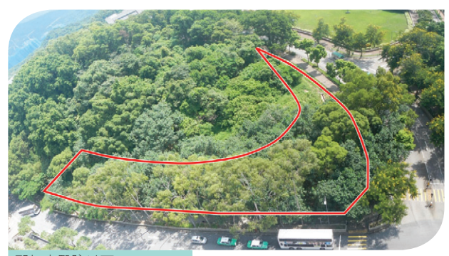
那打素醫院以西 West of Nethersole Hospital