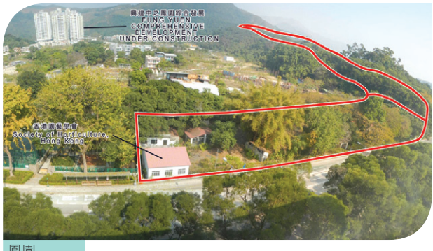
鳳園 Fung Yuen