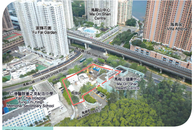
馬錦街 Ma Kam Street