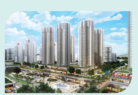
古洞北分區計劃大綱圖及新發展區 Kwu Tung North Outline Zoning Plan and New Development Area