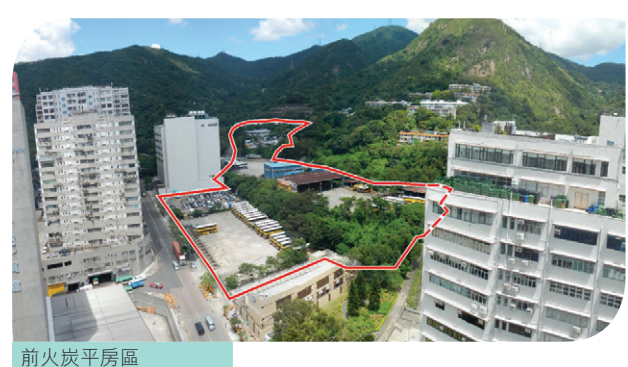
ex-Fo Tan Cottage Area

On 8 November 2013, the Board agreed to propose amendments to the OZP to rezone Shek Mun Estate zoned "R(A)" together with a strip of land zoned "Open Space" ("O") to "R(A)4" for public housing development. The draft Sha Tin OZP No. S/ST/29 was exhibited for public inspection on 22 November 2013. After giving consideration to the 1,391 representations and 11 comments on 16 May 2014 in respect of the OZP, the Board decided not to propose any amendment to the OZP. The draft OZP was approved by CE in C on 2 September 2014 and was subsequently renumbered as S/ST/30.