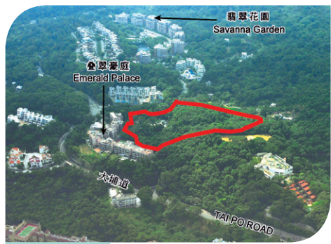
逸遙路 Yat Yiu Avenue