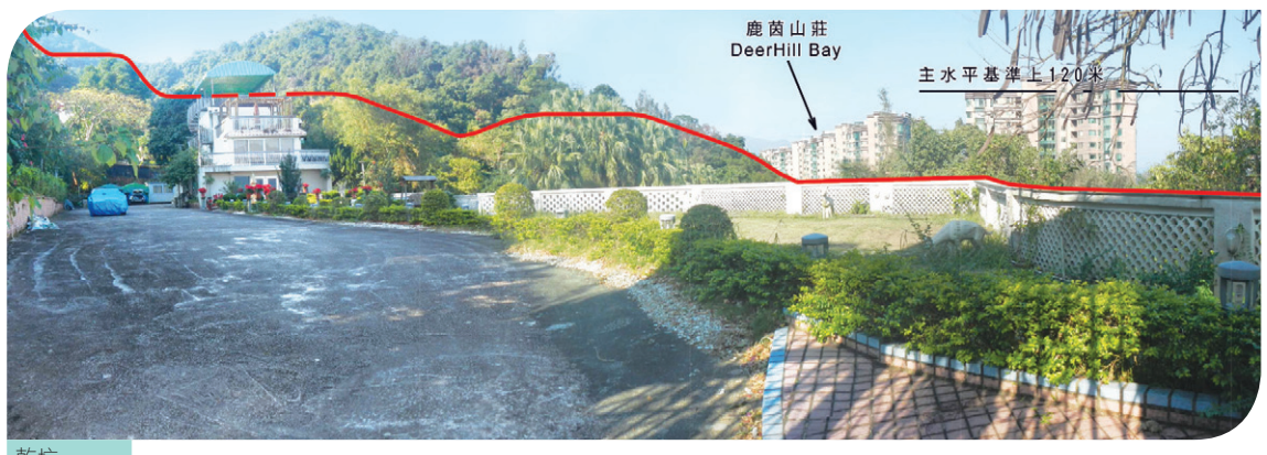
乾坑 Kon Hang