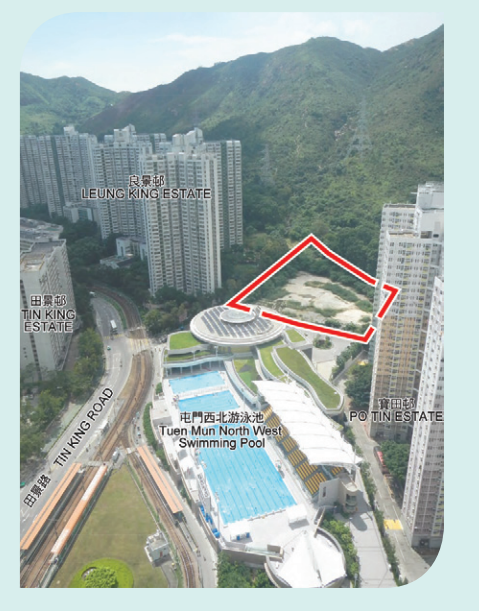
屯門北 Tuen Mun North