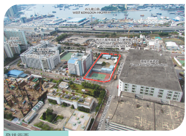
發祥街西 Fat Tseung Street West