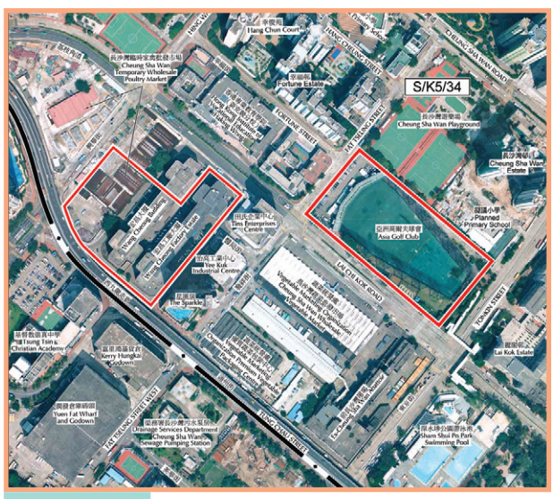
長沙灣 Cheung Sha Wan

height restriction of the neighbouring Lai Kok Estate and was in line with the stepped building height profile for the Cheung Sha Wan district. The draft Cheung Sha Wan OZP No. S/K5/34 was exhibited for public inspection on 19 April 2013. After giving consideration to the 698 representations and 170 comments in respect of the OZP on 4 October 2013, the Board decided not to propose any amendment to the OZP. On 17 December 2013, CE in C approved the draft Cheung Sha Wan OZP which was renumbered as S/K5/35.