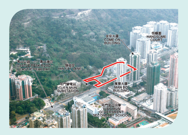
屯門中 Tuen Mun Central