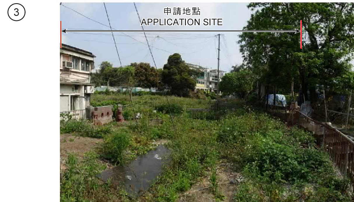
申請地點界線只作識別用 APPLICATION SITE BOUNDARY FOR IDENTIFICATION PURPOSE ONLY