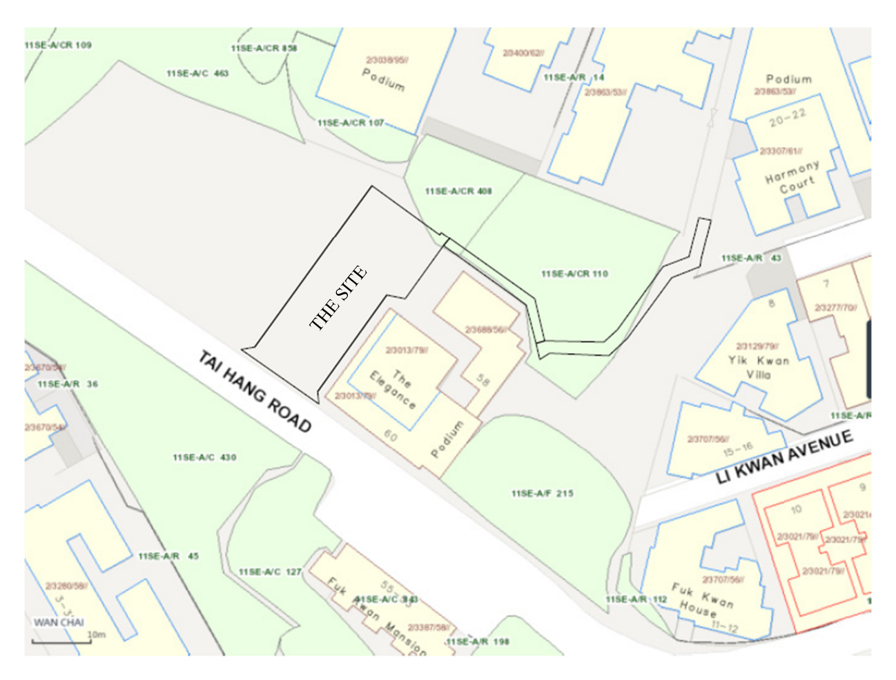
Figure 2 Layout of Adjacent Buildings with BD reference nos.