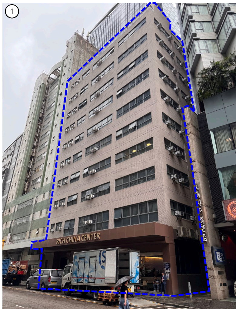
Front entrance at Hung To Road