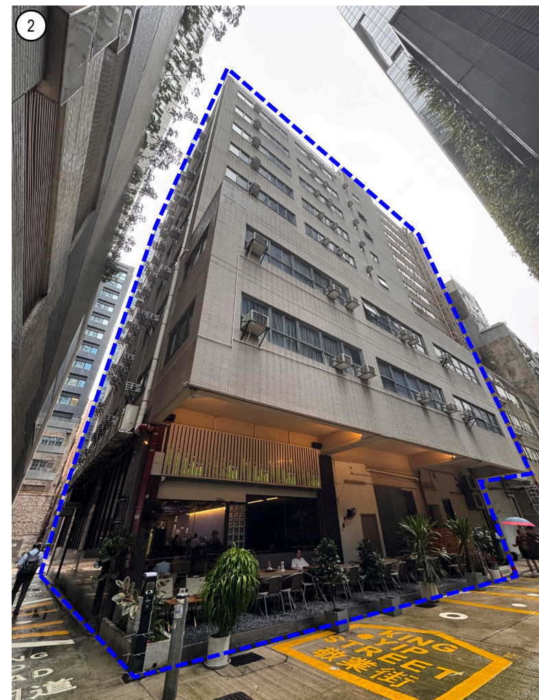
Back alley of the Application Site connecting to King Yip Street