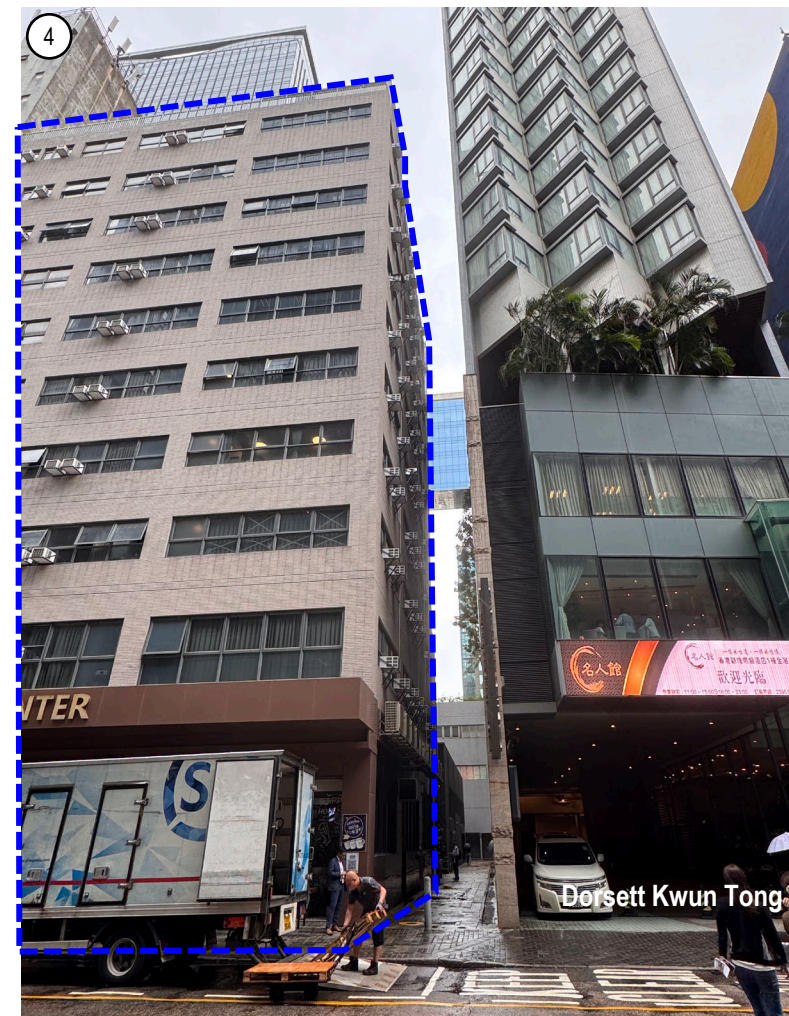
An existing hotel development adjacent to the Application Site