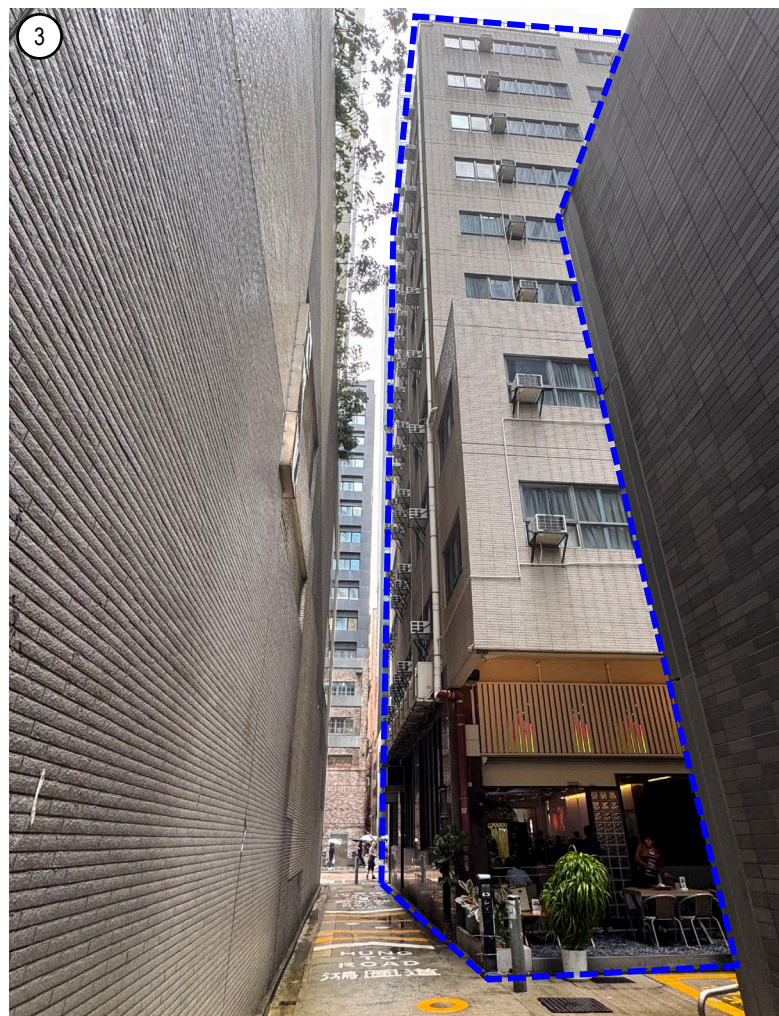
Pedestrian lane towards Hung To Road