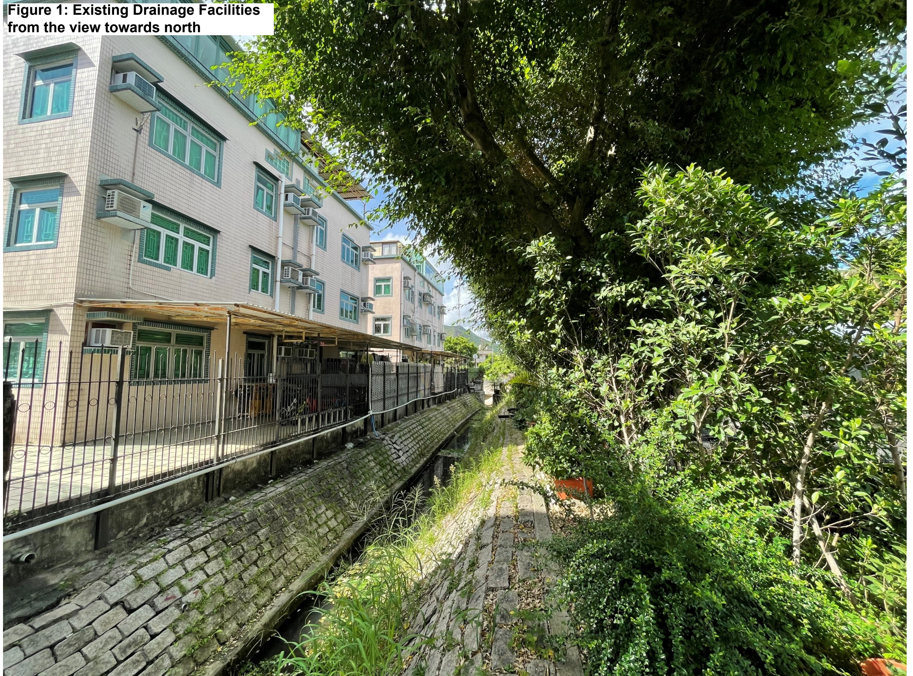
Figure 1: Existing Drainage Facilities from the view towards north