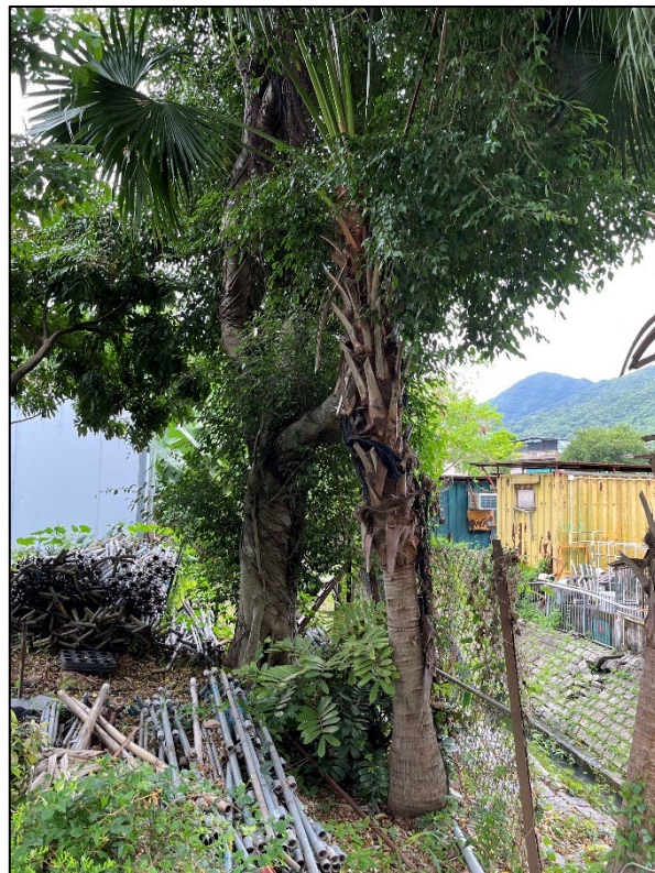
T10 & T11