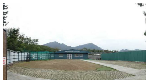
Existing Structure in the Application Site