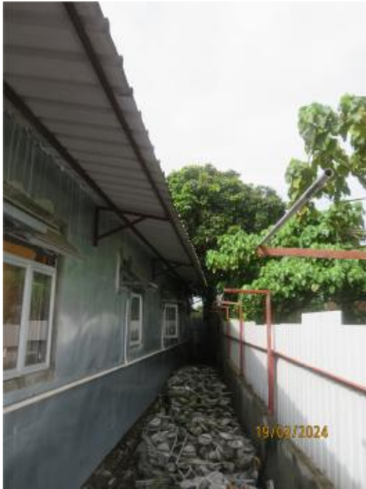
DD90 lot 524 S.B