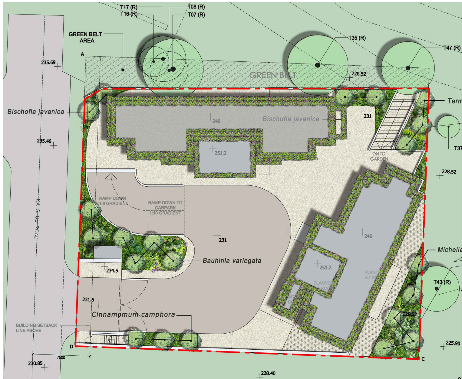
APPROVED S16 LANDSCAPE MASTERPLAN SCHEME (APPROVAL DATE 03 JANUARY 2020)