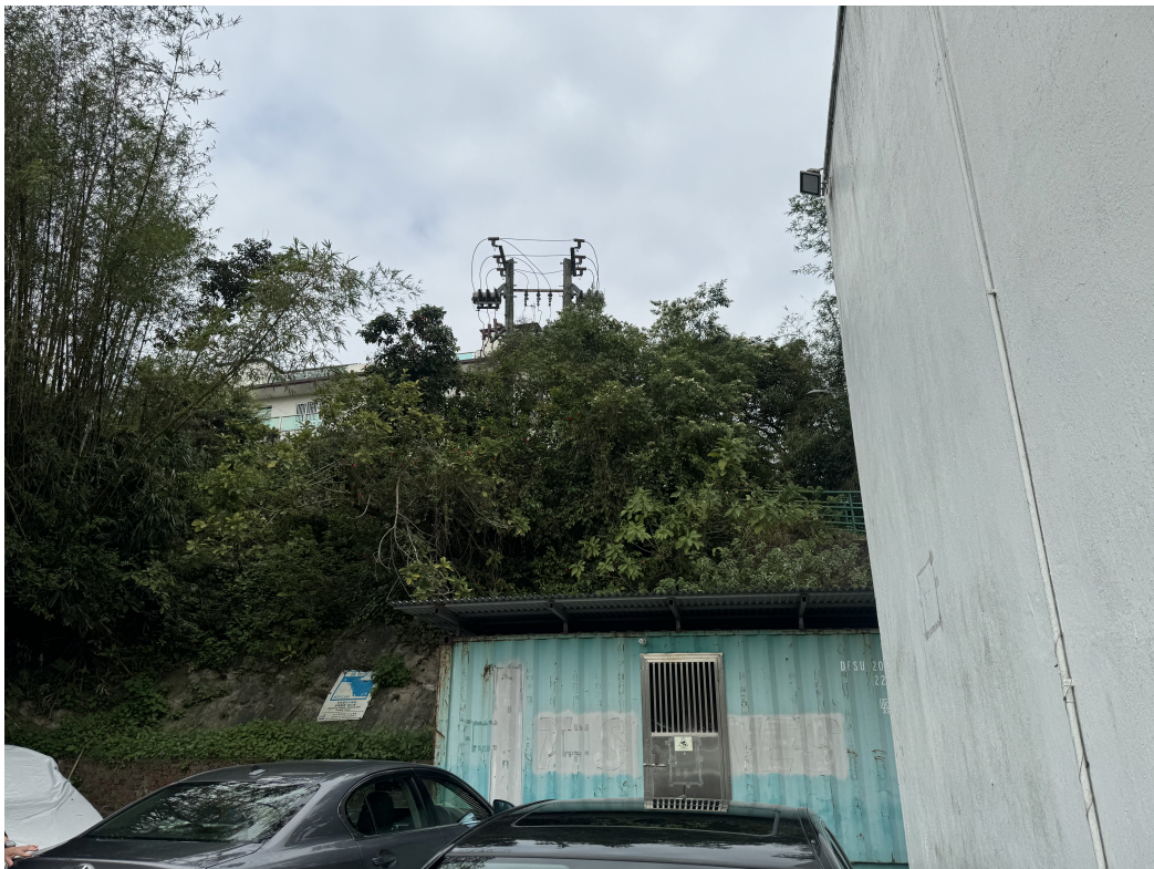
VP B - Village Office at Tseng Lan Shue