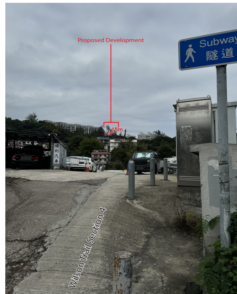
Photo A2 - Proposed Development at the Subject Site