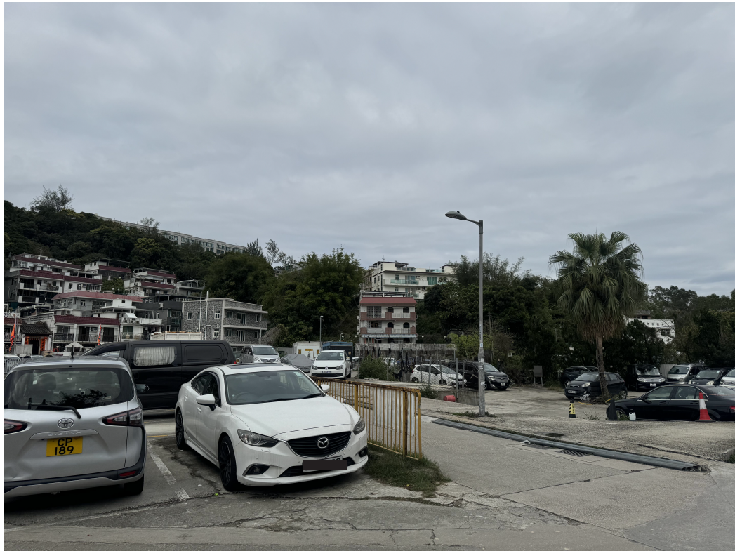
VP A - Pavilion at Tseng Lan Shue