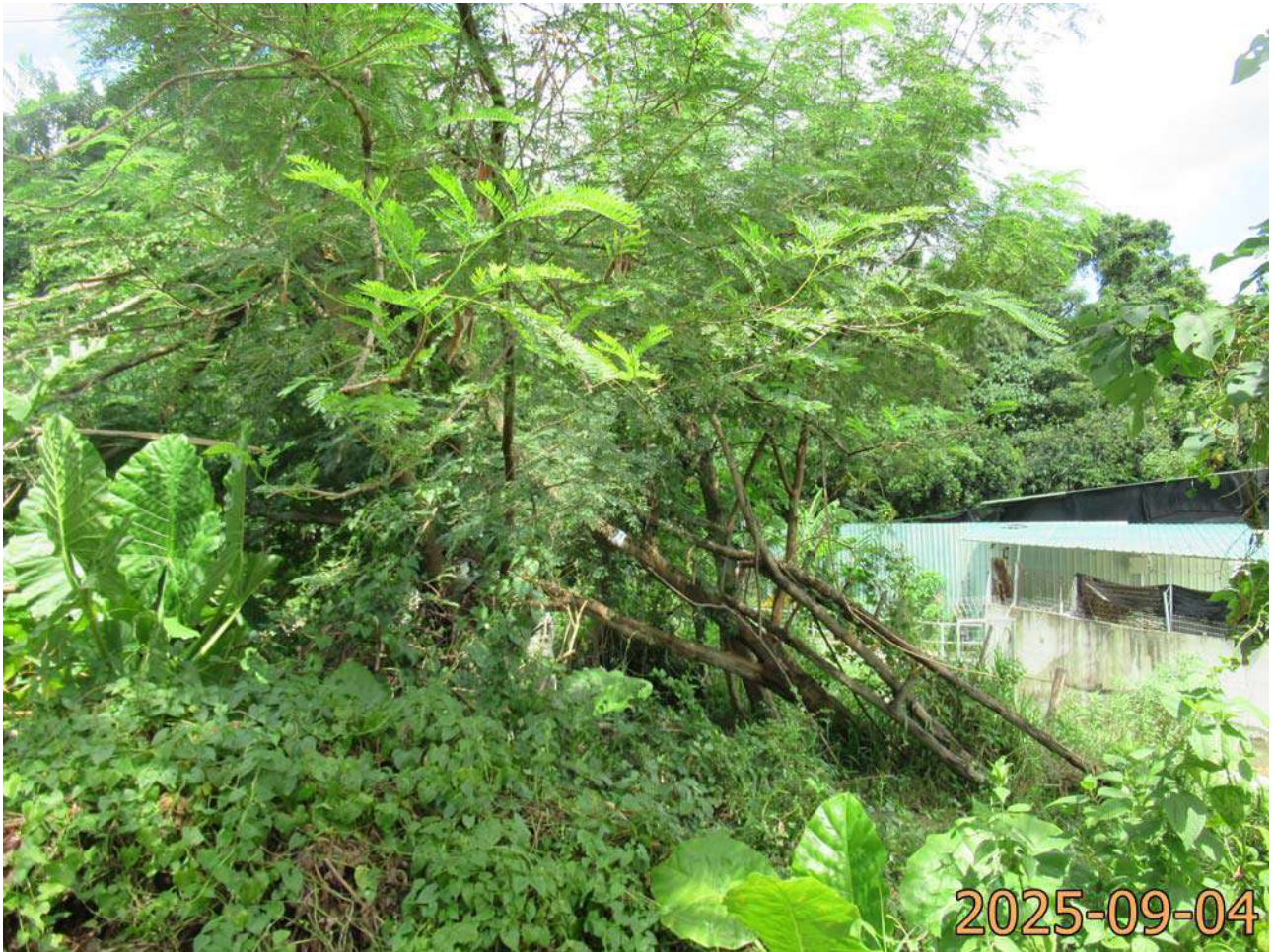
General view 09