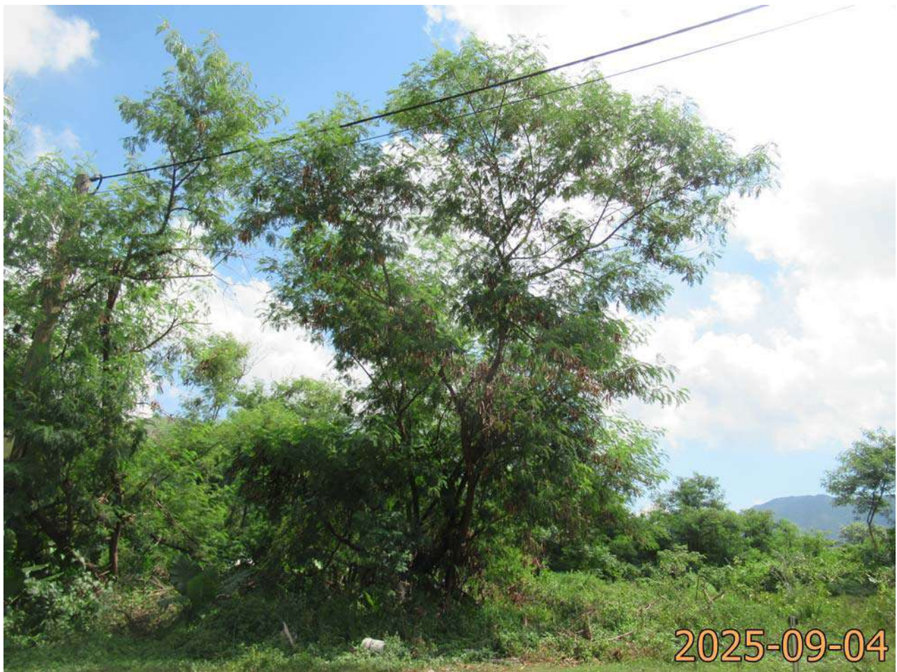
General view 01