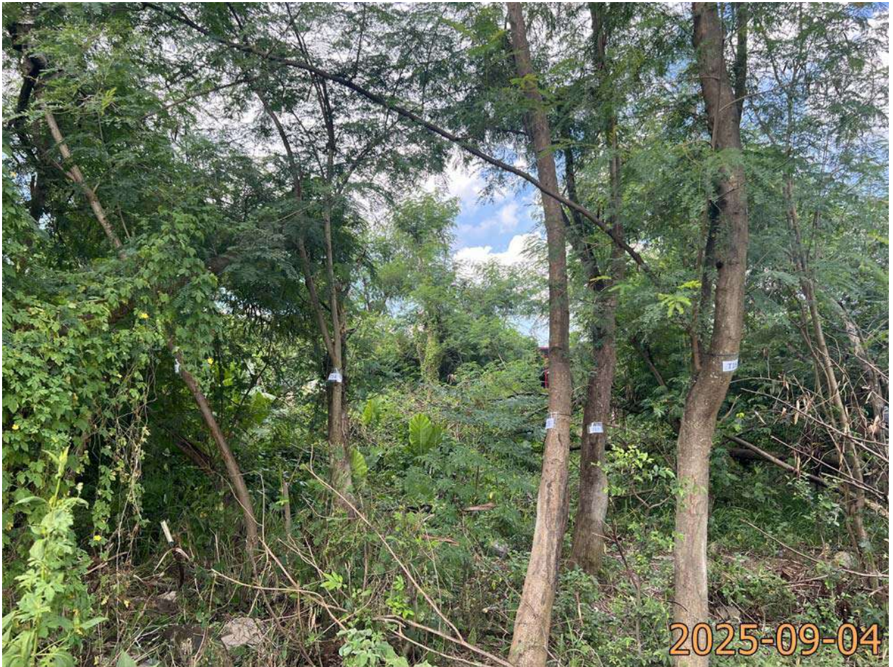
General view 05