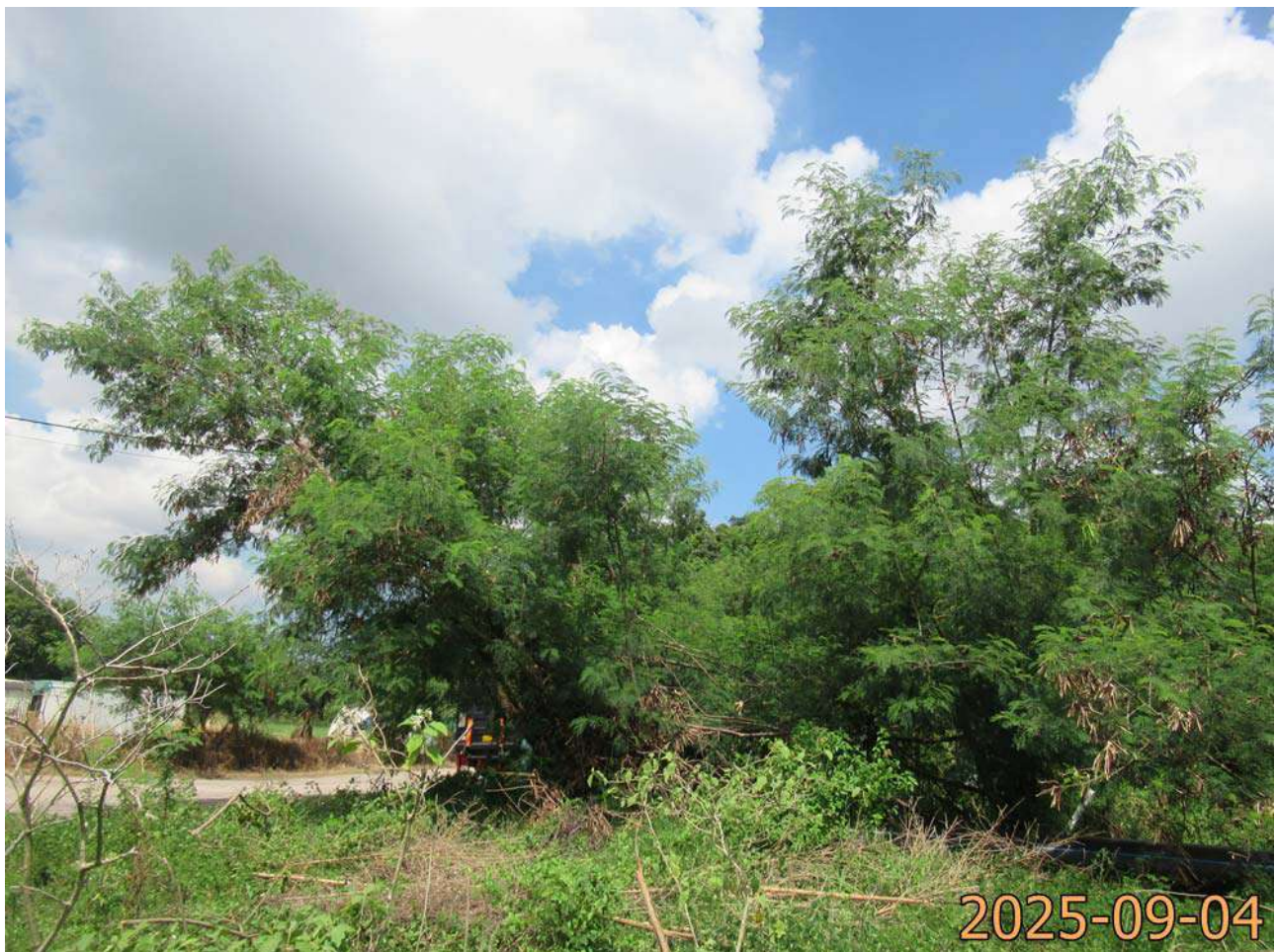
General view 02