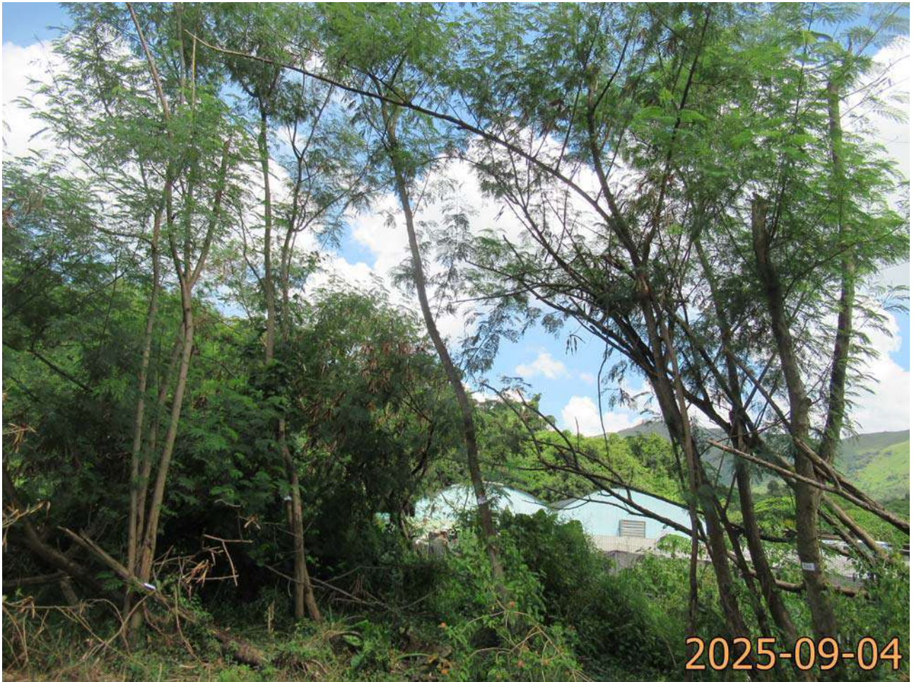
General view 07