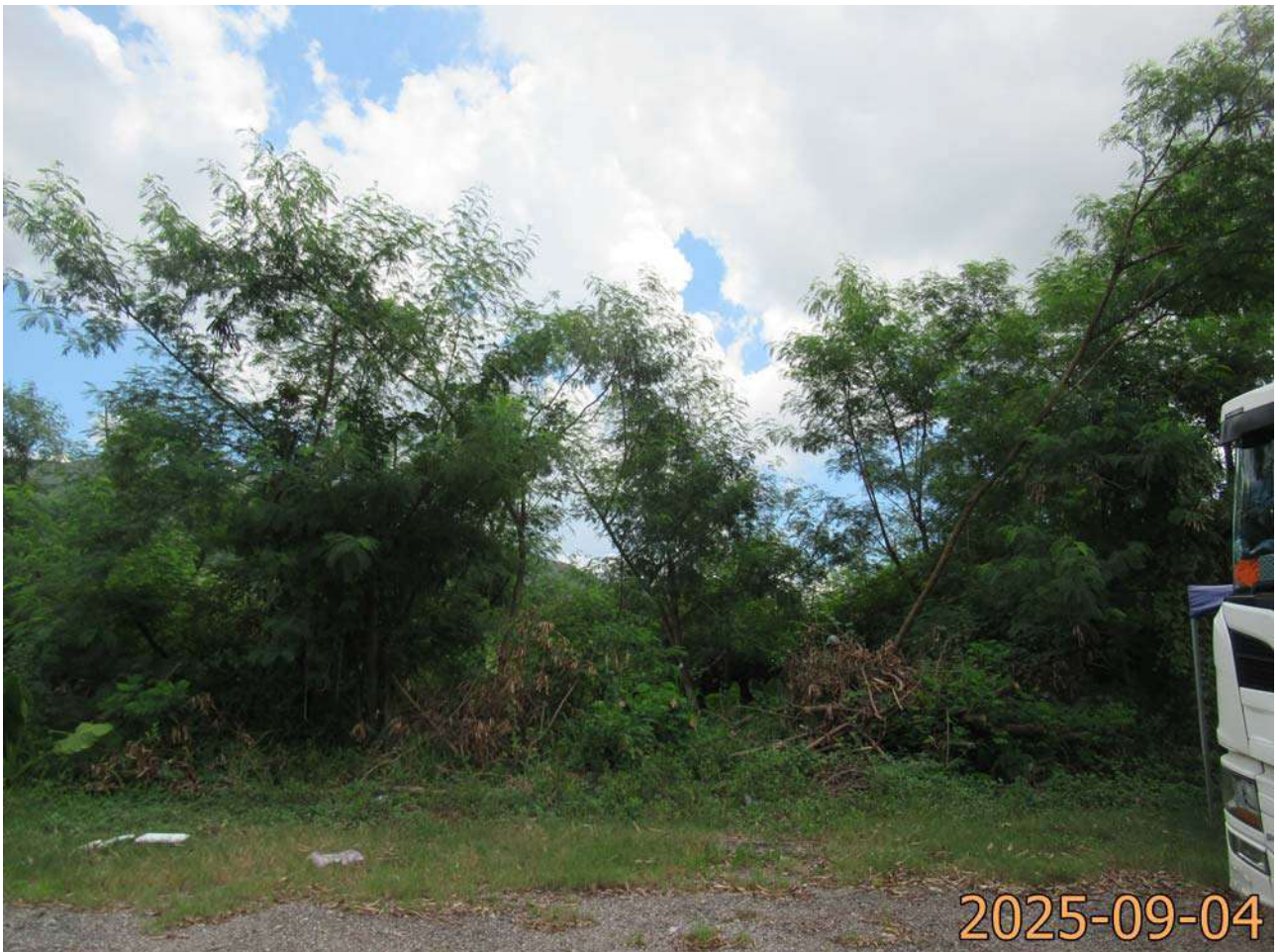
General view 08