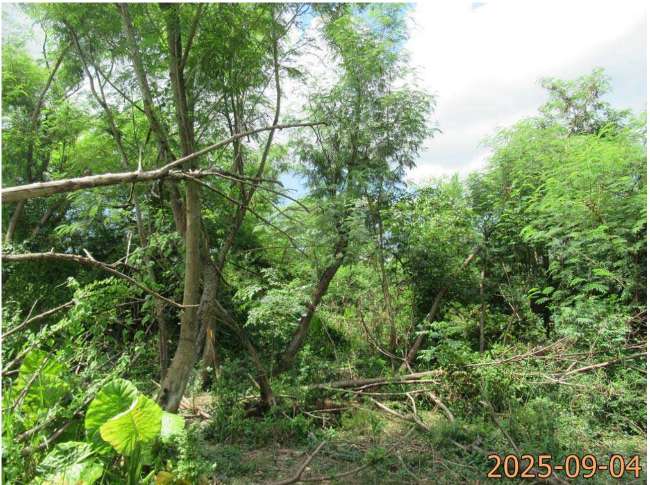
General view 06