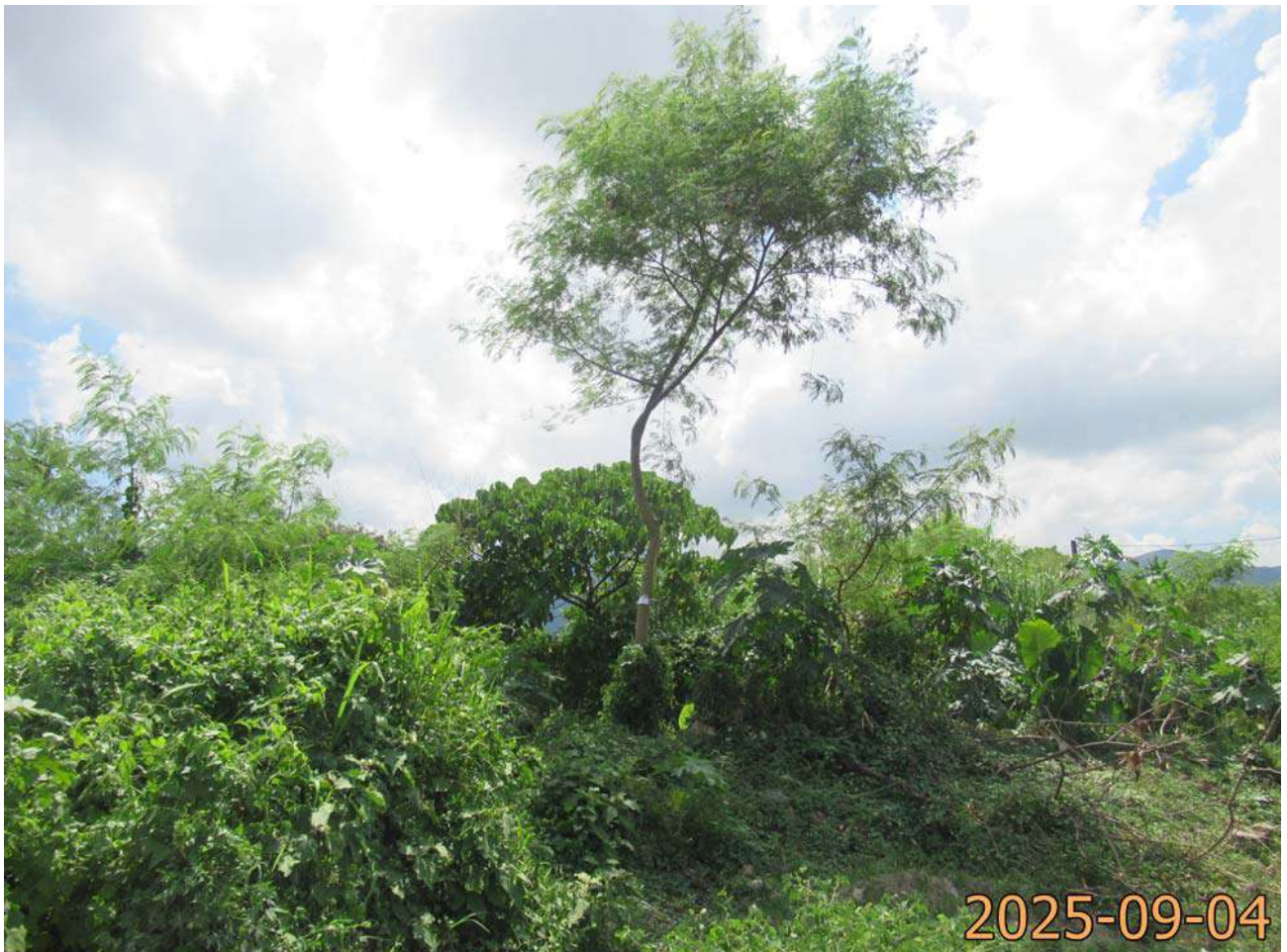
General view 04