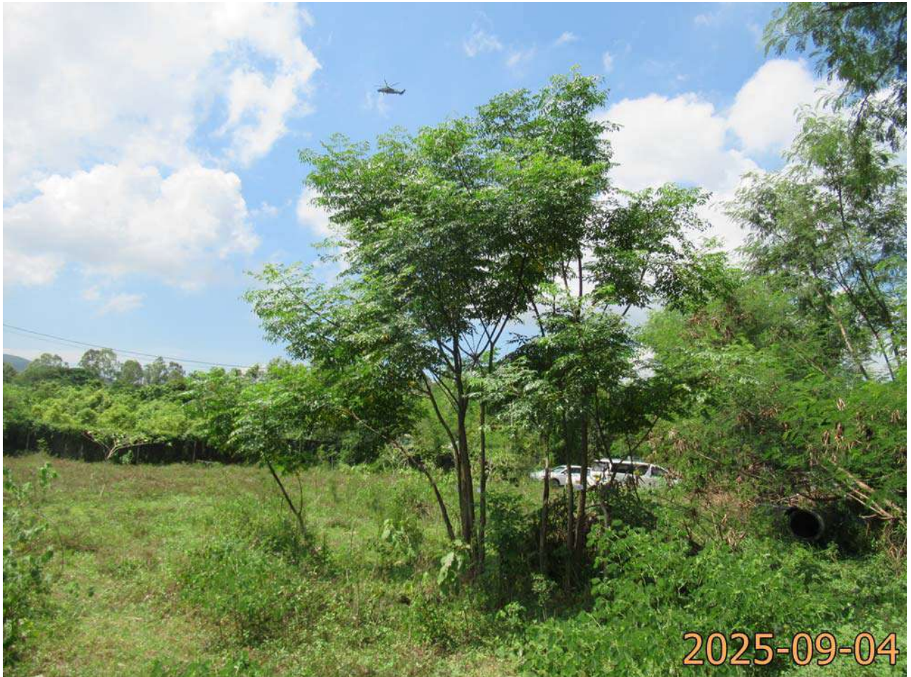
General view 03