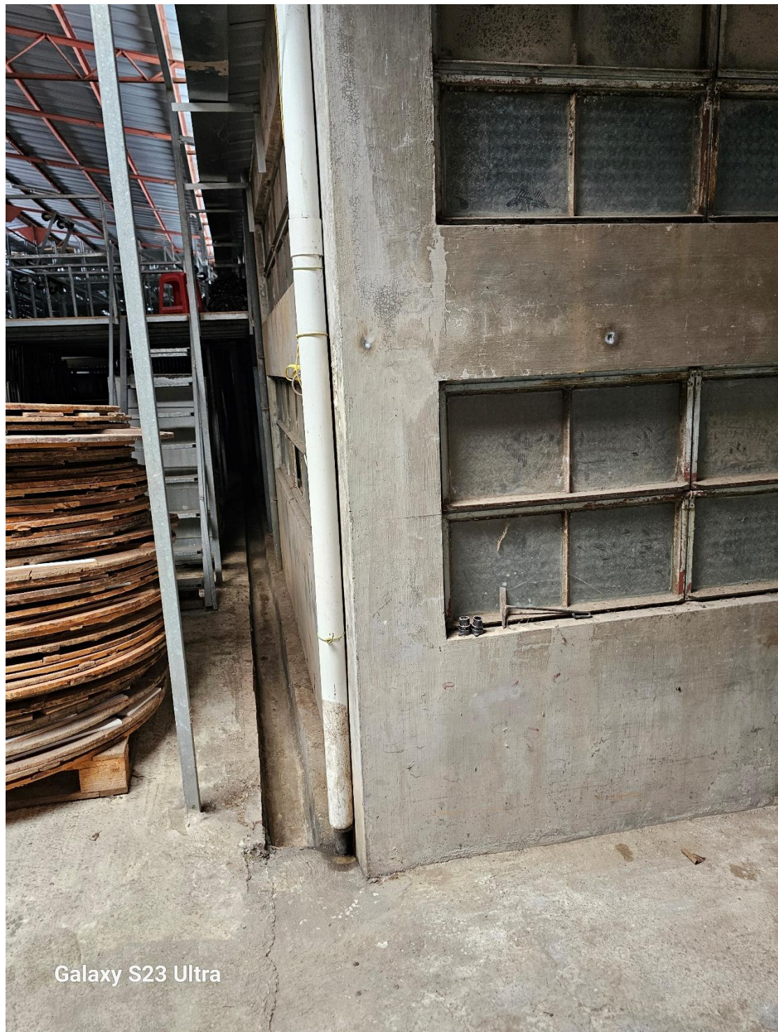
Photo B- Existing Drainage System Lot 1445 S.A (Part) TPB /A/YL-SK/432