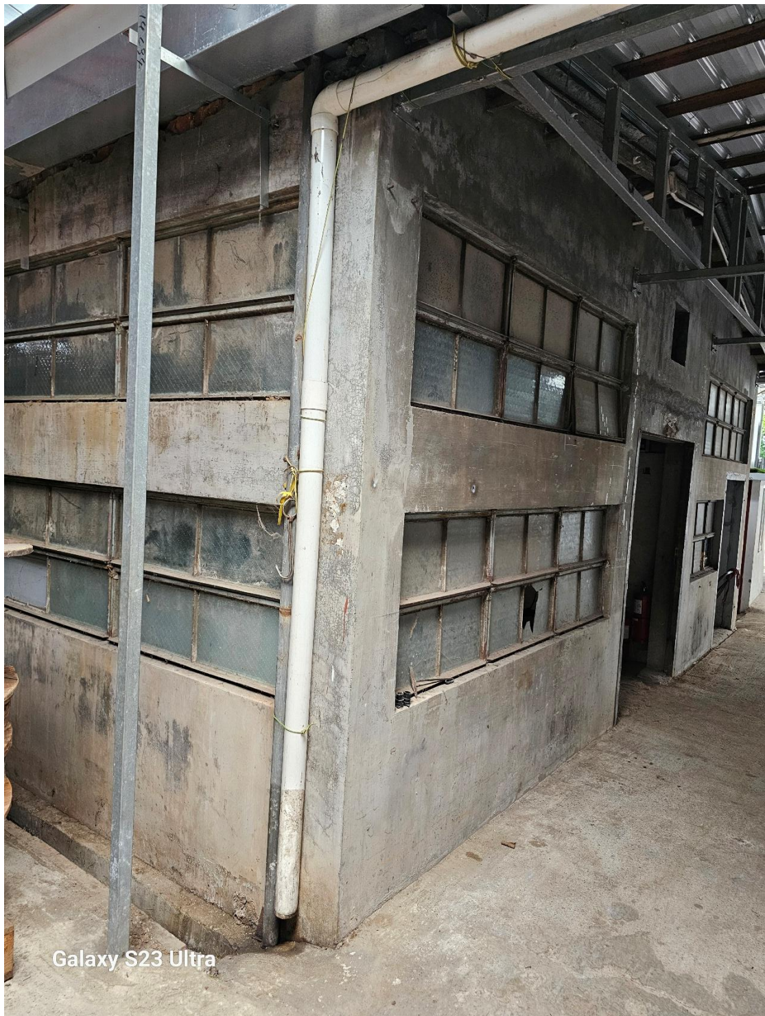
Photo A- Existing Drainage System Lot 1445 S.A (Part) TPB /A/YL-SK/432