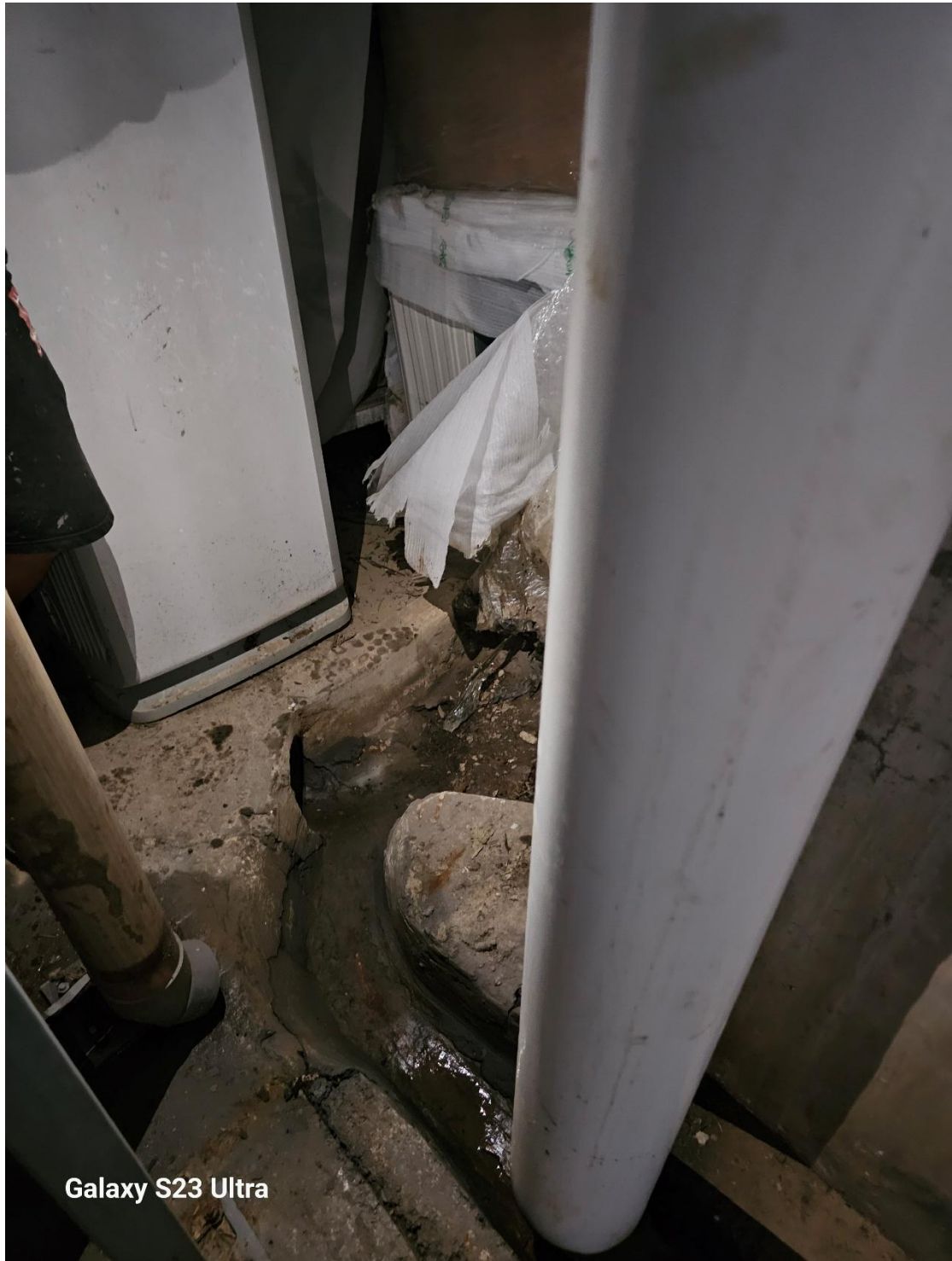
Photo D- Existing Drainage System Lot 1445 S.A (Part) TPB /A/YL-SK/432