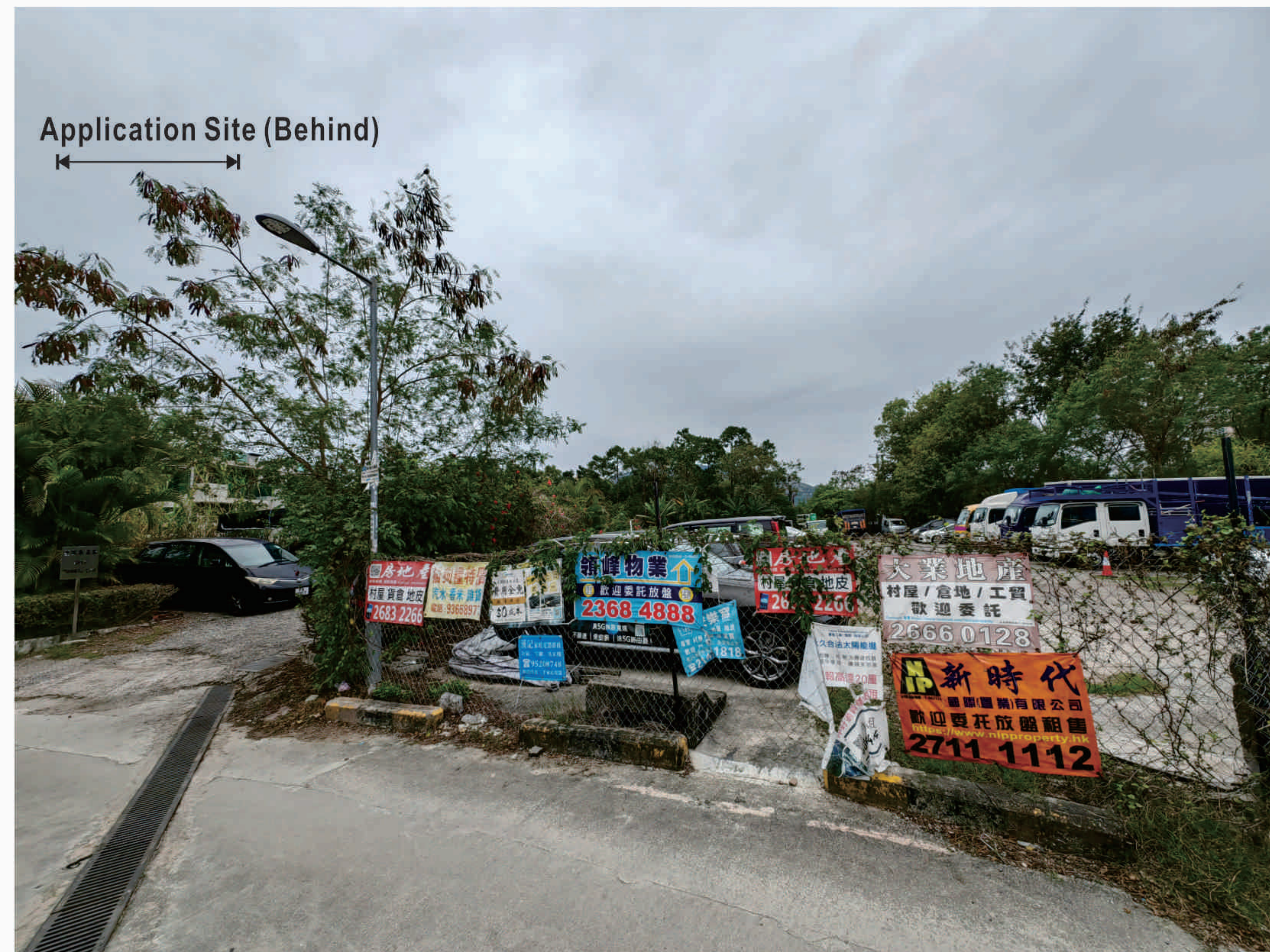
VP 1: Siu Hang Tsuen Sitting Out Area