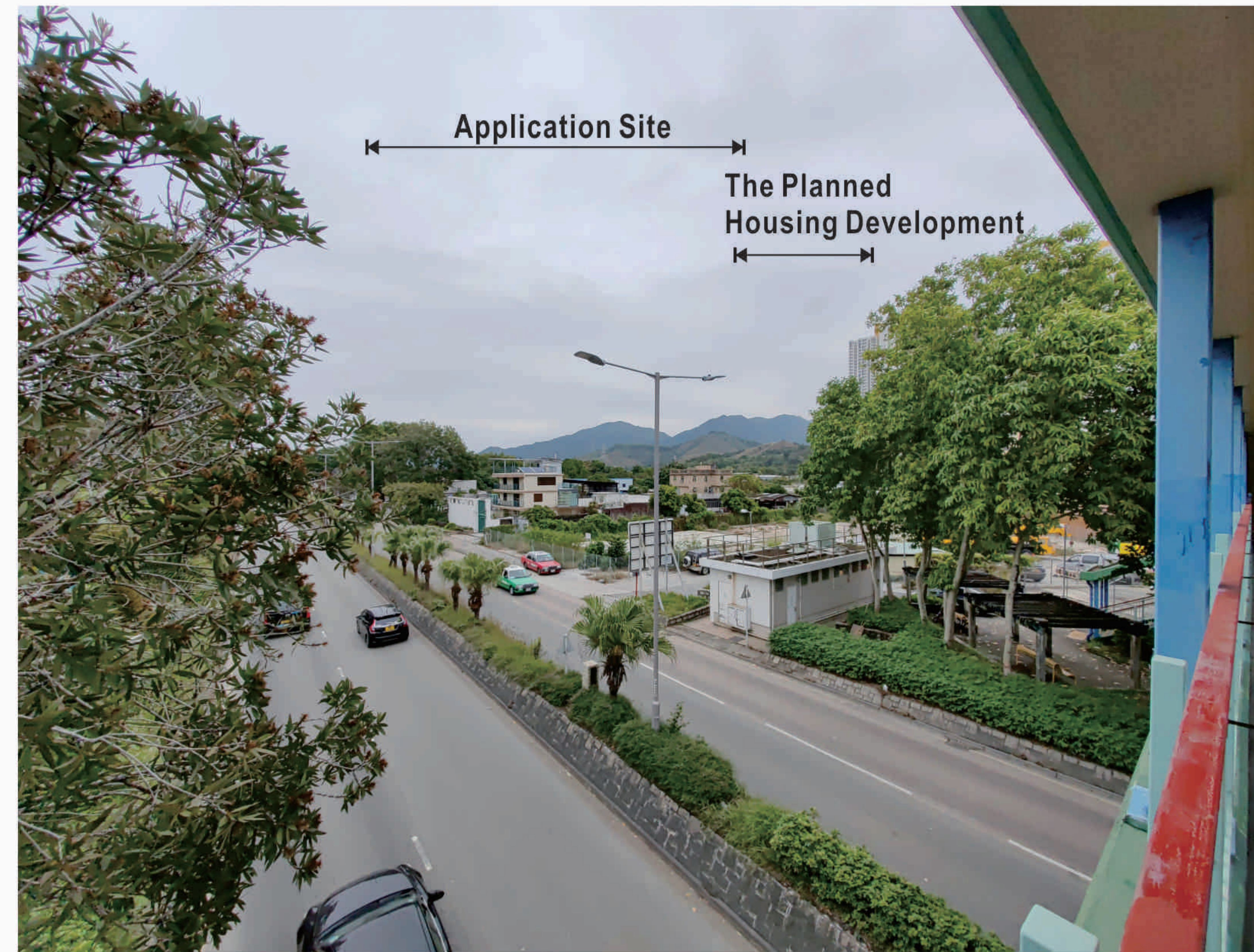
VP 7: View looking towards the Subject Site from Footbridge (to the East of the Site) across Castle Peak Road - Lung Yeuk Tau (Existing Situation)