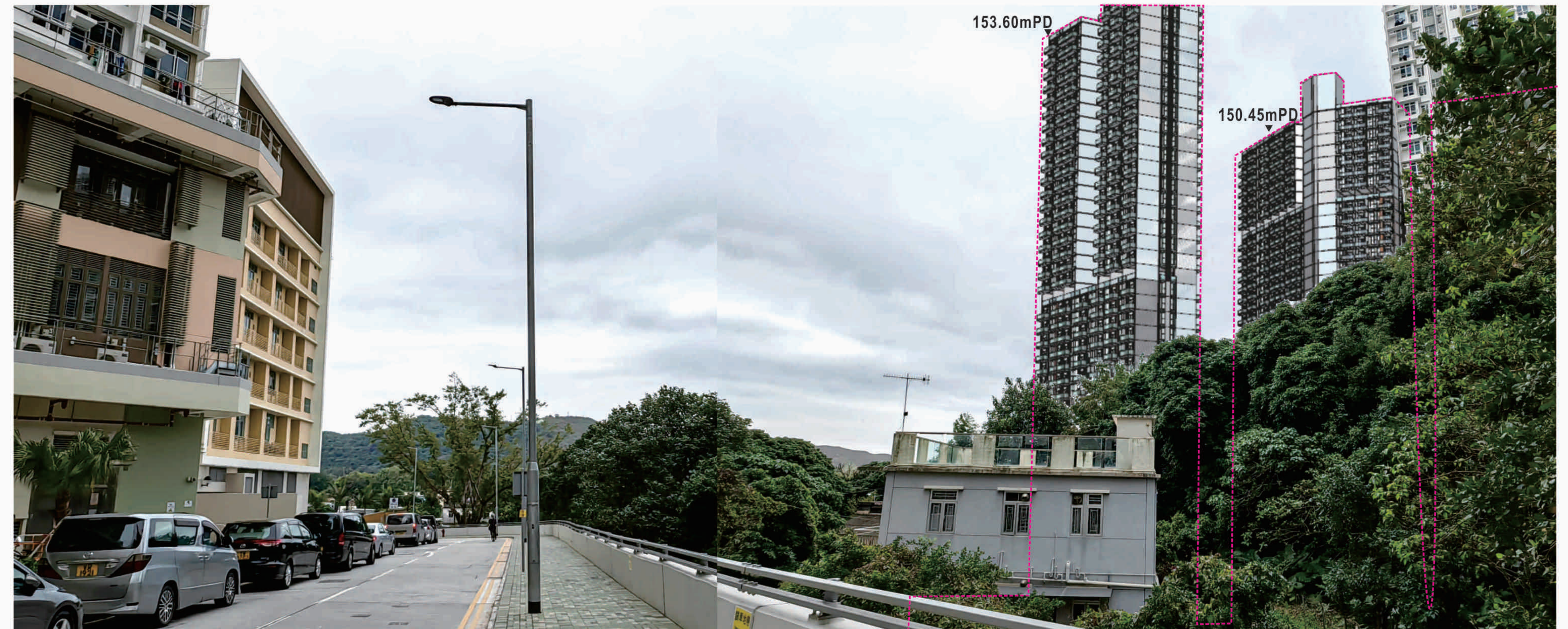
VP 4: View looking towards the Subject Site from Amenity Area at Queen Hill Estate (with Proposed Scheme)