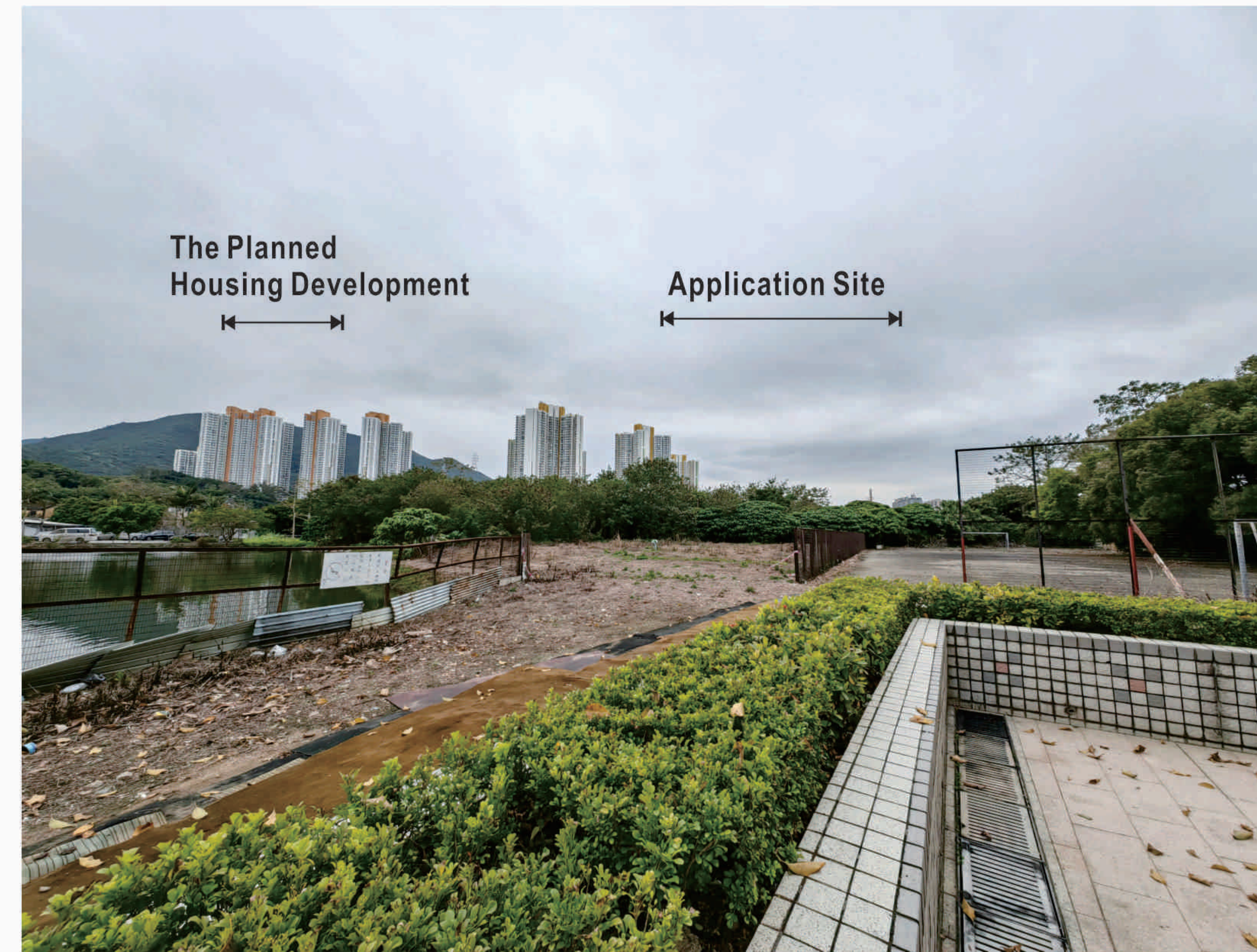
VP 6: View looking towards the Subject Site from Kwan Tei Children Playground (Existing Situation)