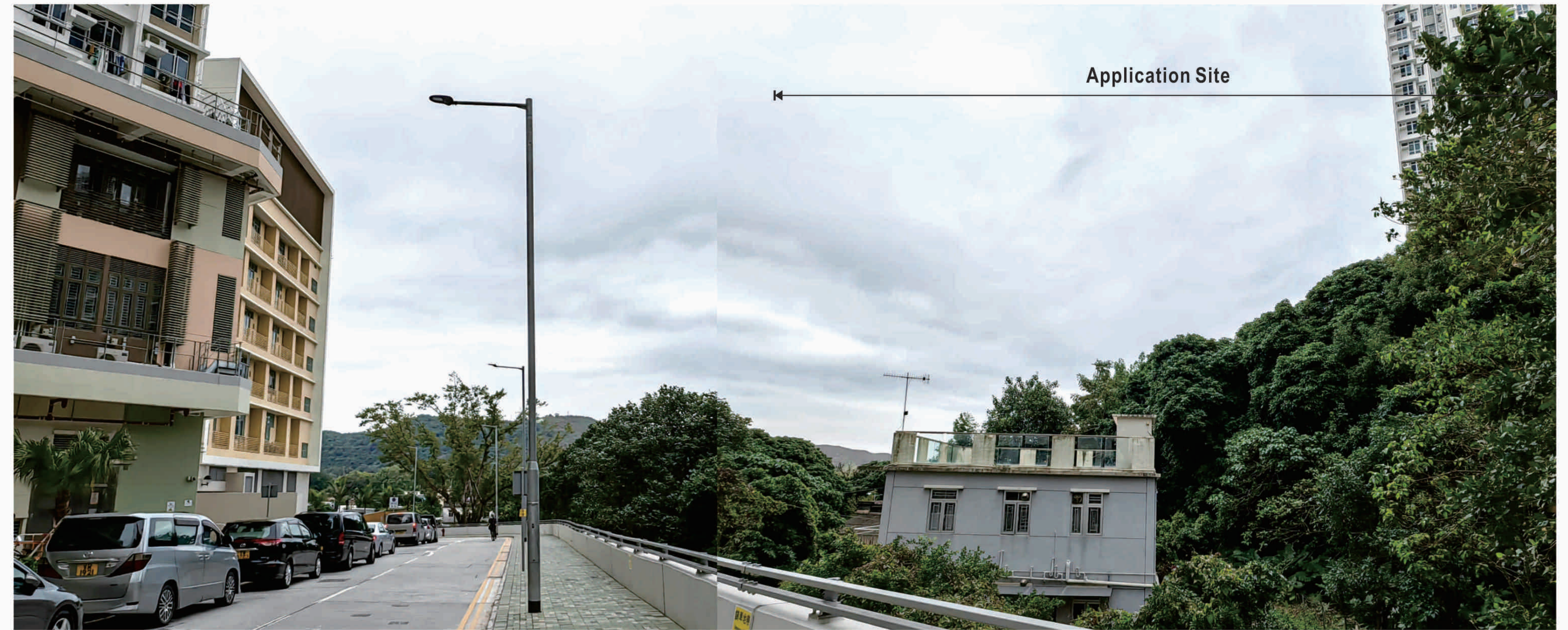
VP 4: View looking towards the Subject Site from Amenity Area at Queen Hill Estate (Existing Situation)