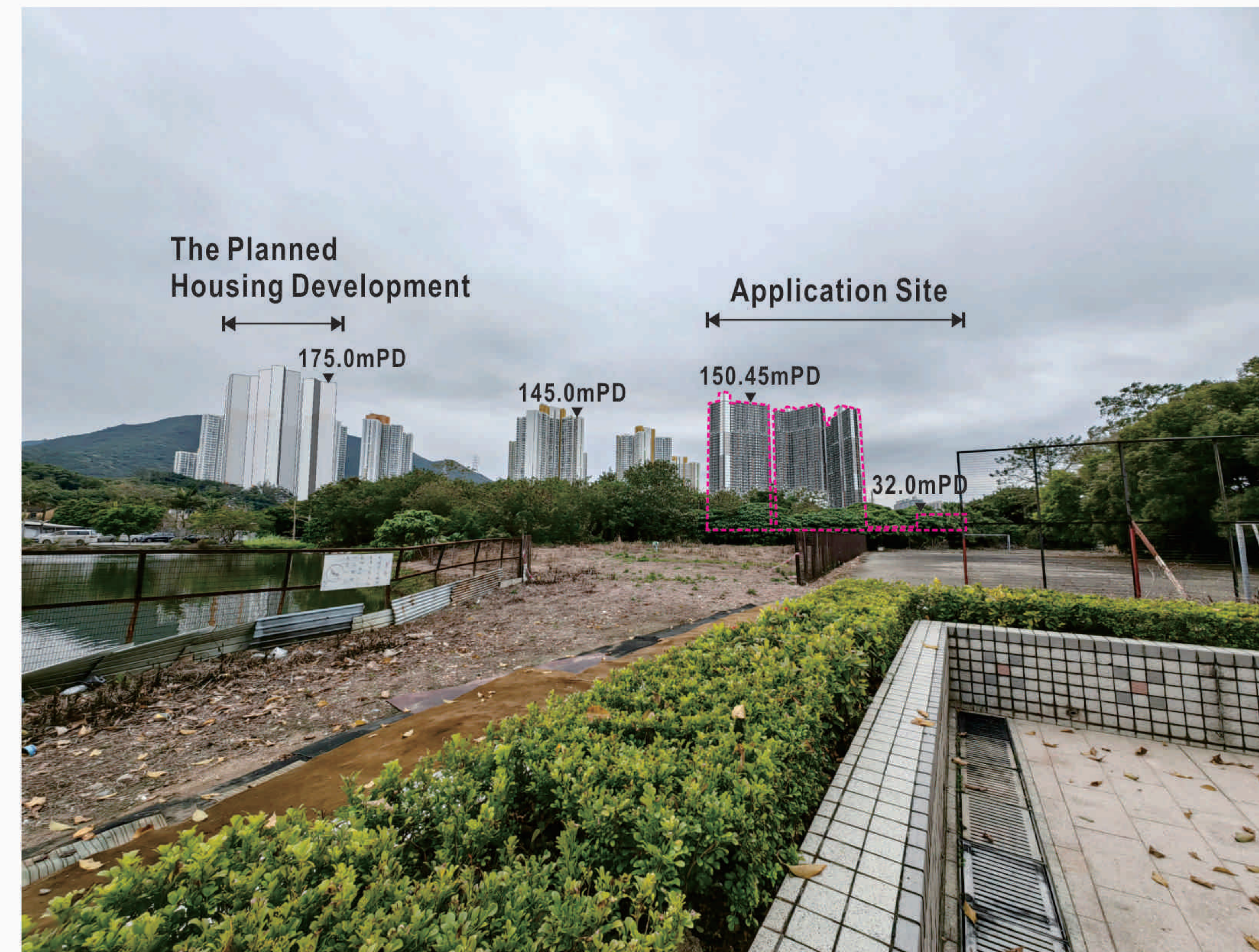
VP 6: View looking towards the Subject Site from Kwan Tei Children Playground (with Proposed Scheme)