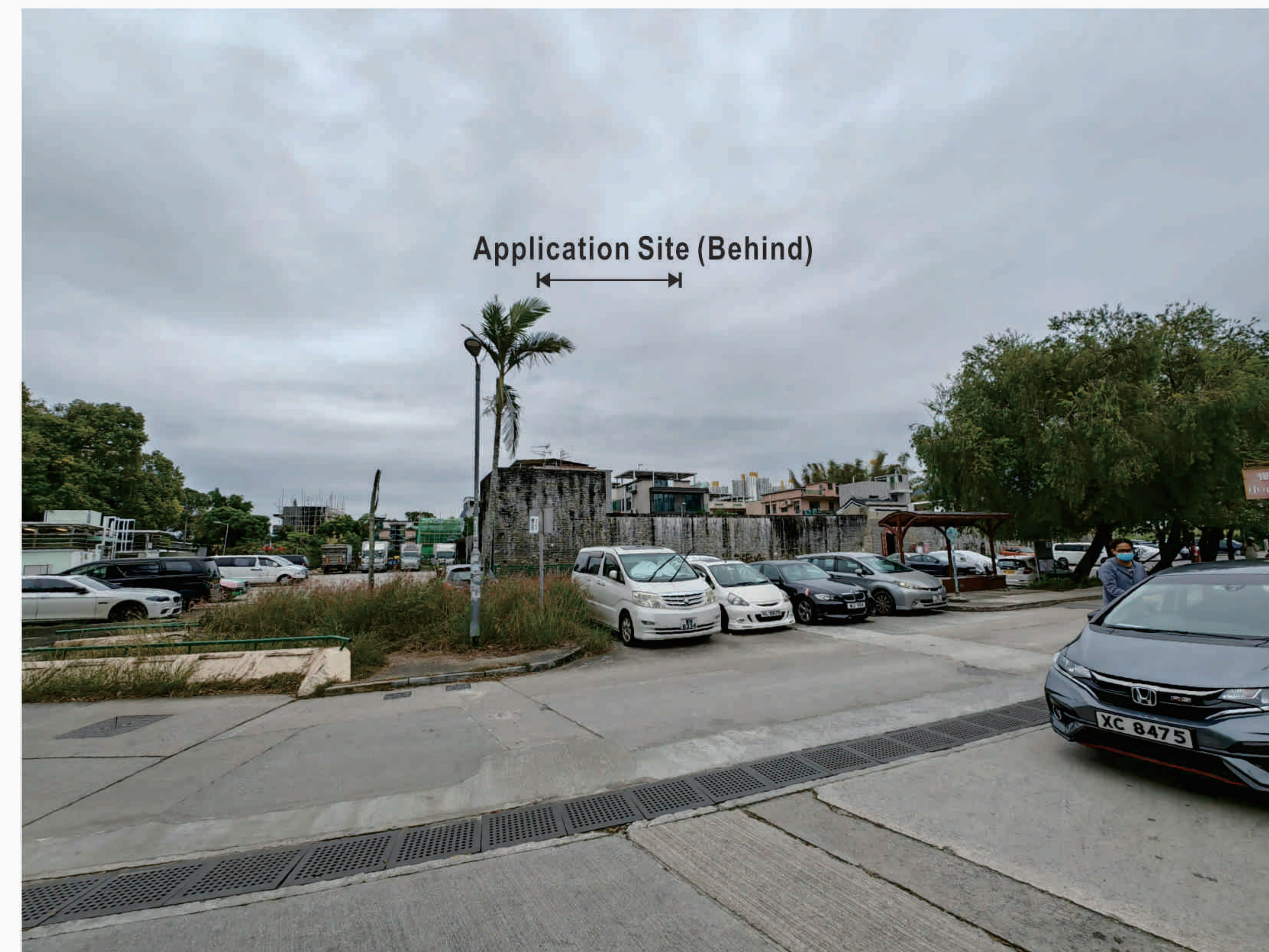
VP 2: Lung Yuek Tau San Wai Children Playground