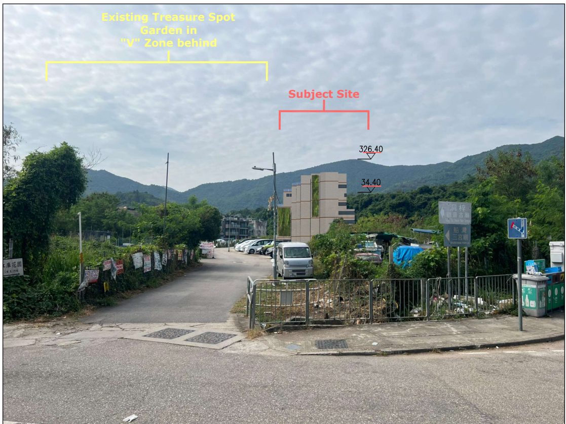
Proposed development (Scheme B)