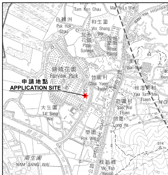
要覽圖 KEY PLAN SCALE 1 : 50 000 比例尺