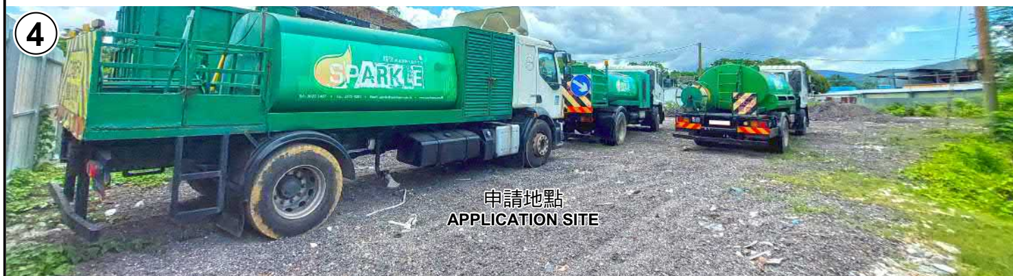
申請地點 APPLICATION SITE

申請地點界線只作識別用 APPLICATION SITE BOUNDARY FOR IDENTIFICATION PURPOSE ONLY