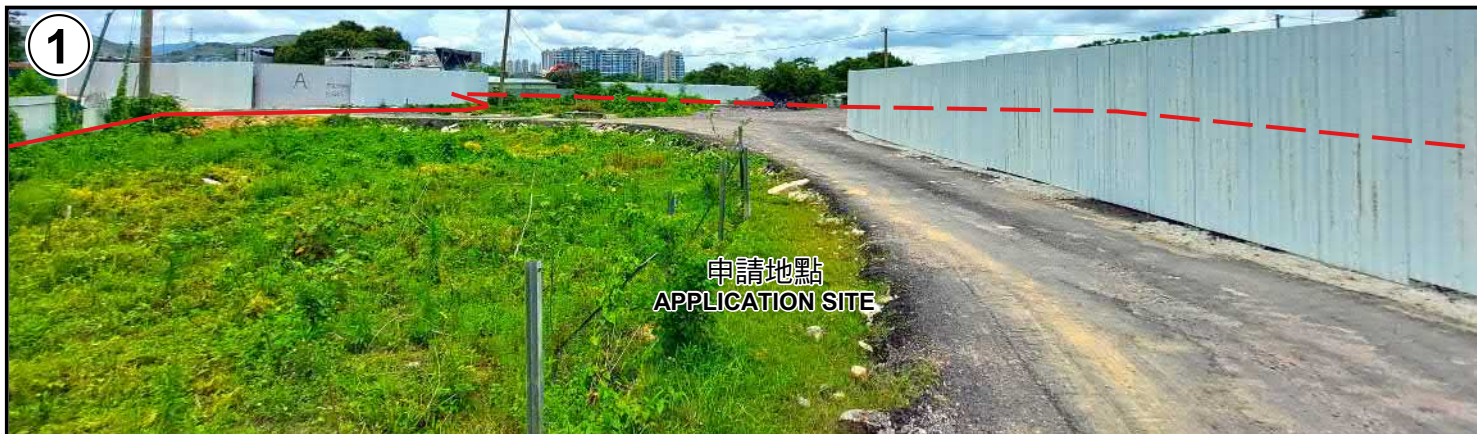
申請地點 APPLICATION SITE