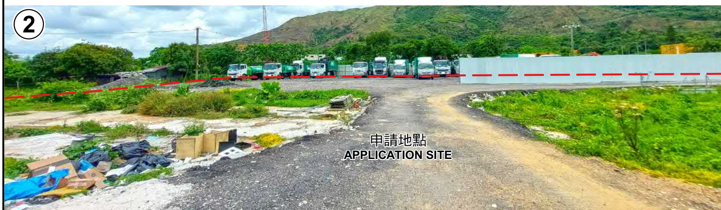
申請地點 APPLICATION SITE