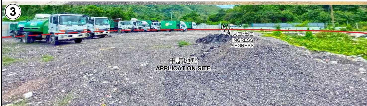
申請地點 APPLICATION SITE