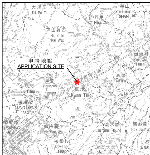
要覽圖 KEY PLAN