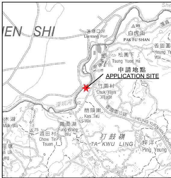
要覽圖 KEY PLAN SCALE 1:50 000 比例尺