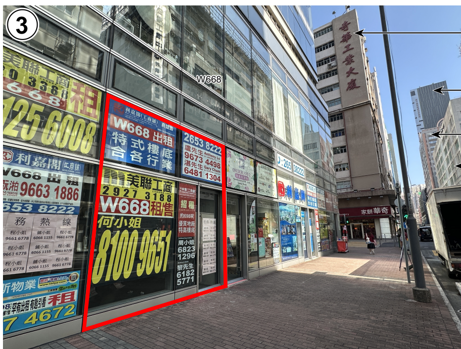
奇華工業大廈 Kee Wah Industrial Building