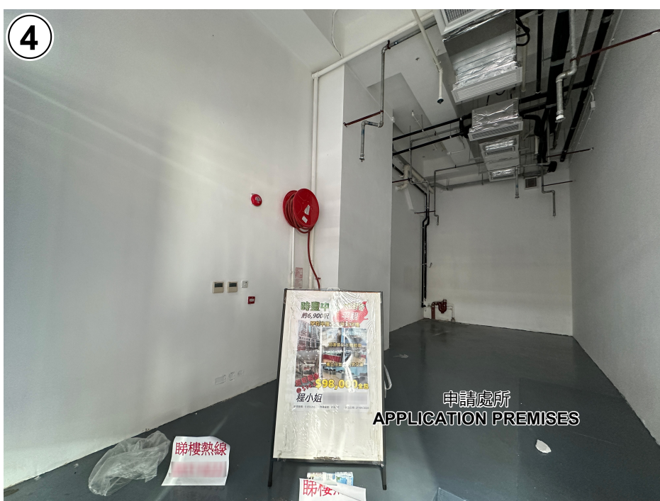
申請處所 APPLICATION PREMISES

申請處所界線只作識別用 APPLICATION PREMISES BOUNDARY FOR IDENTIFICATION PURPOSE ONLY