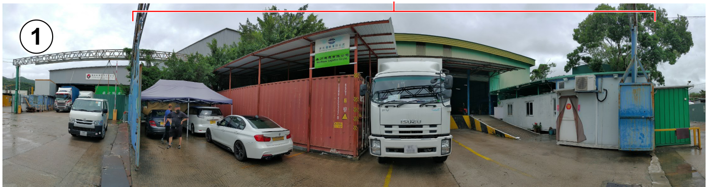
申請地點 APPLICATION SITE