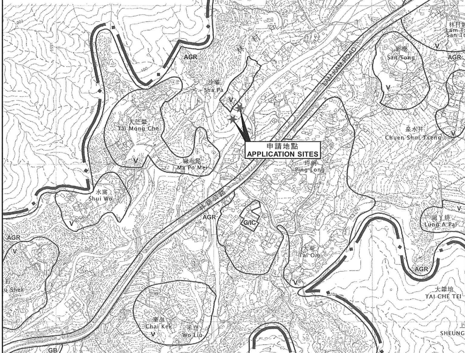
位置圖 LOCATION PLAN

本摘要圖於2022年5月6日擬備， 所根據的資料為於2006年10月31日 核准的分區計劃大綱圖編號S/NE-LT/11 EXTRACT PLAN PREPARED ON 6.5.2022 BASED ON OUTLINE ZONING PLAN No. S/NE-LT/11 APPROVED ON 31.10.2006