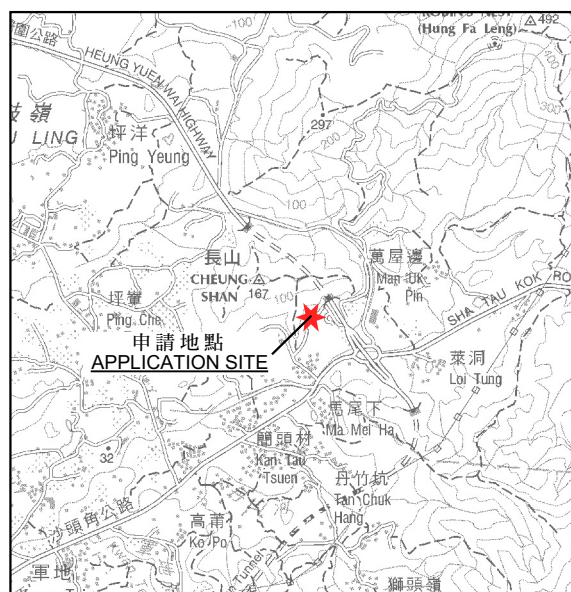
要覽圖 KEY PLAN