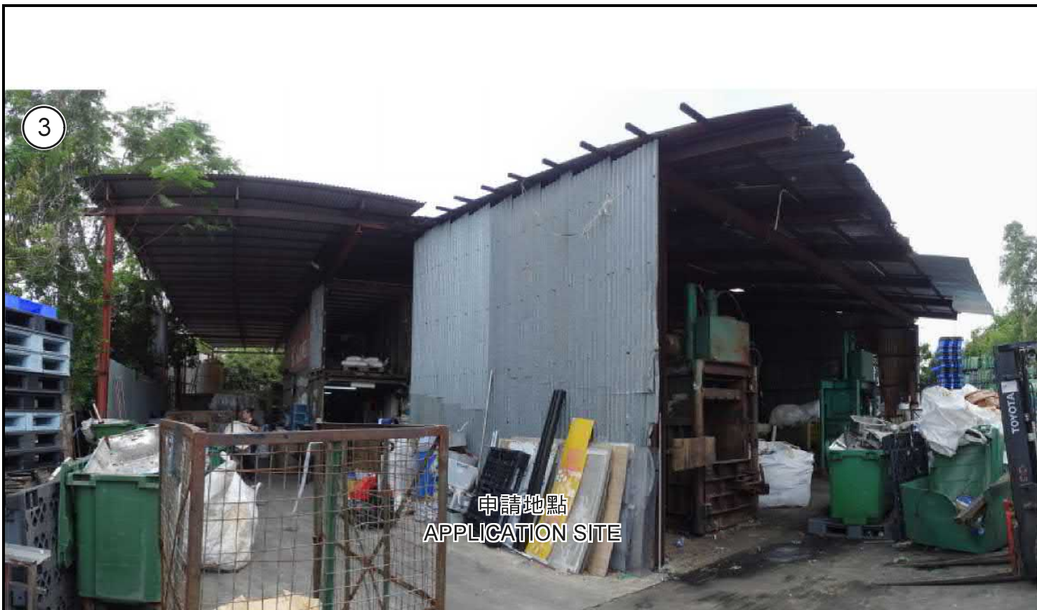
申請地點 APPLICATION SITE