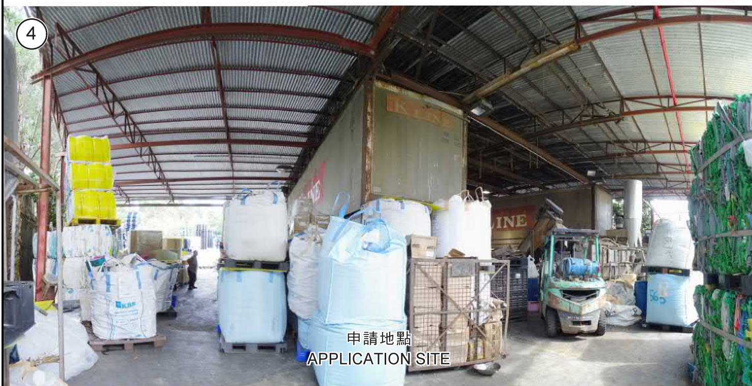
申請地點 APPLICATION SITE