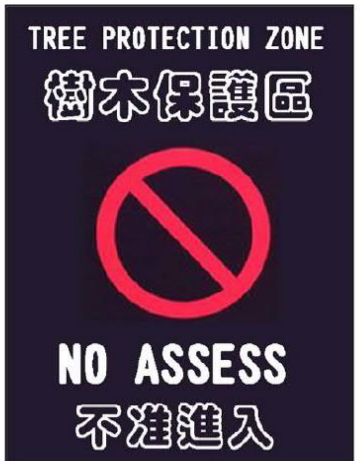
Figure 5. Example of TPZ signage