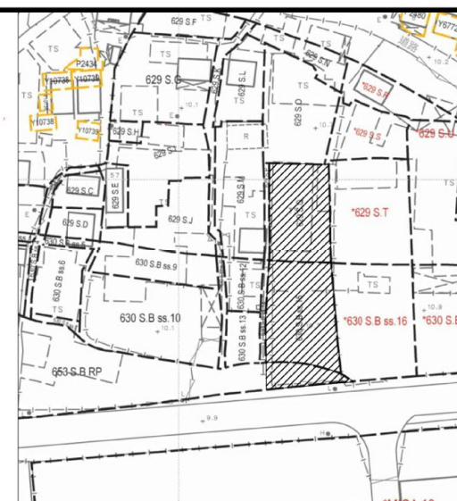
BLOCK PLAN (SCALE 1:1000)