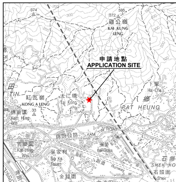
要覽圖 KEY PLAN