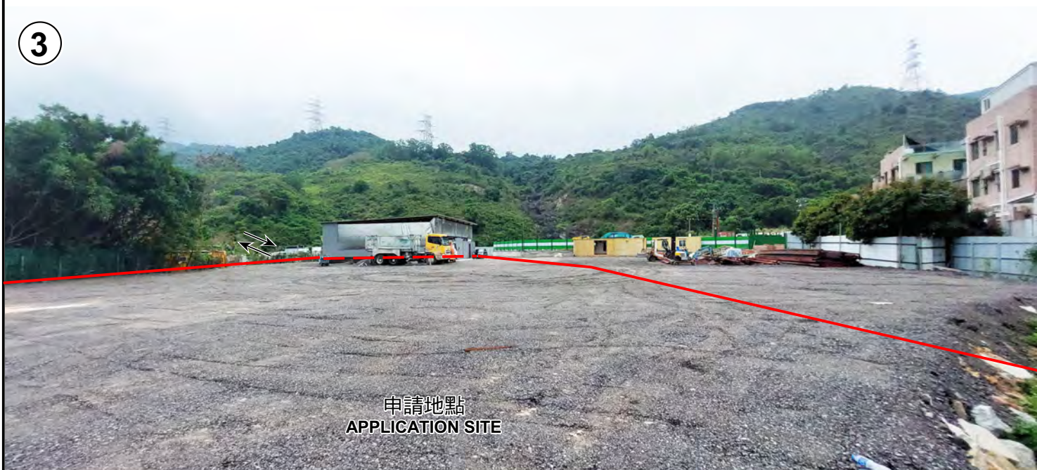
申請地點 APPLICATION SITE