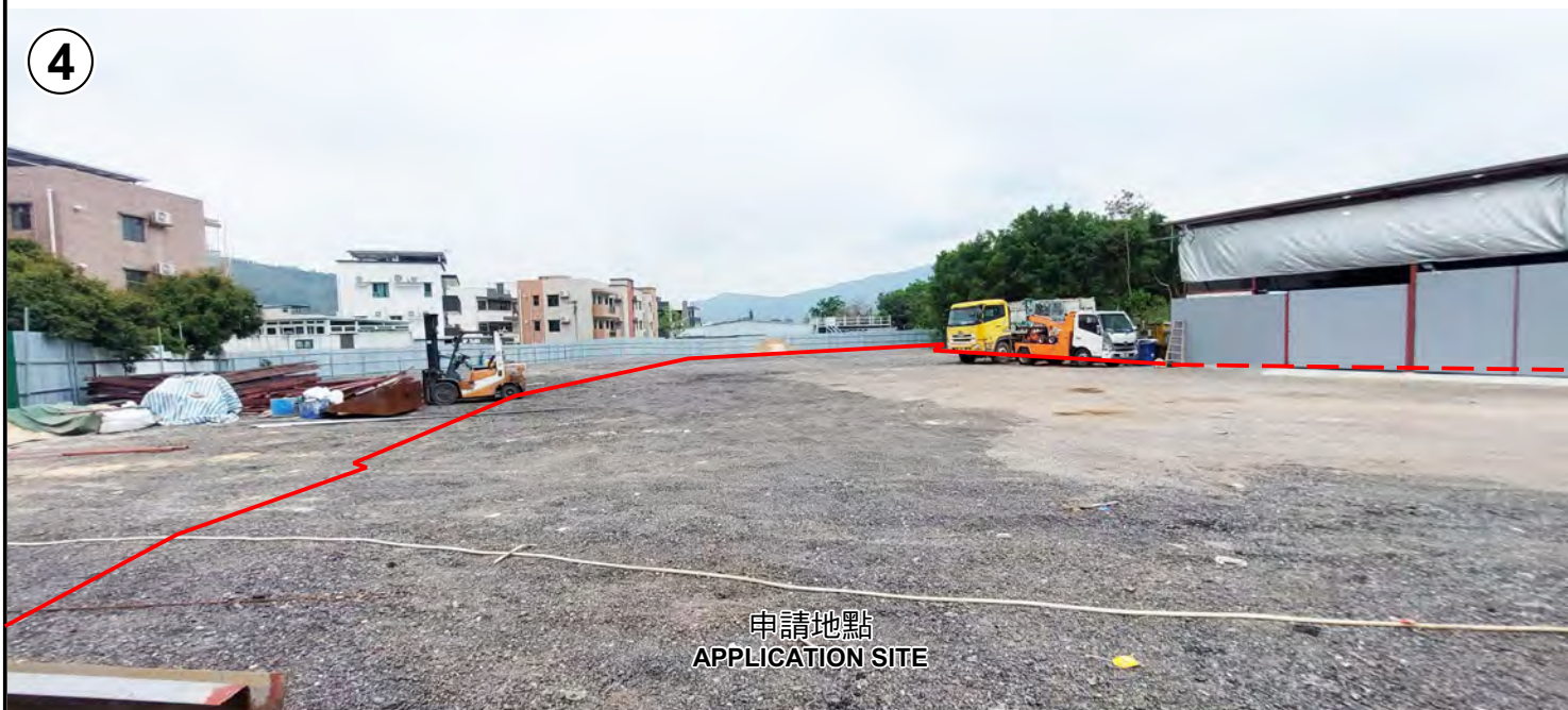
申請地點 APPLICATION SITE

申請地點界線只作識別用 APPLICATION SITE BOUNDARY FOR IDENTIFICATION PURPOSE ONLY