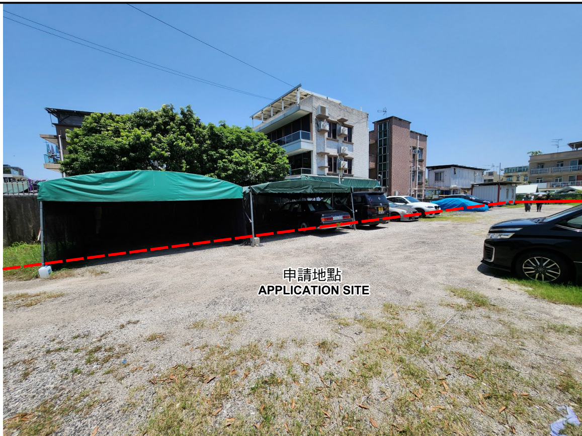
申請地點 APPLICATION SITE