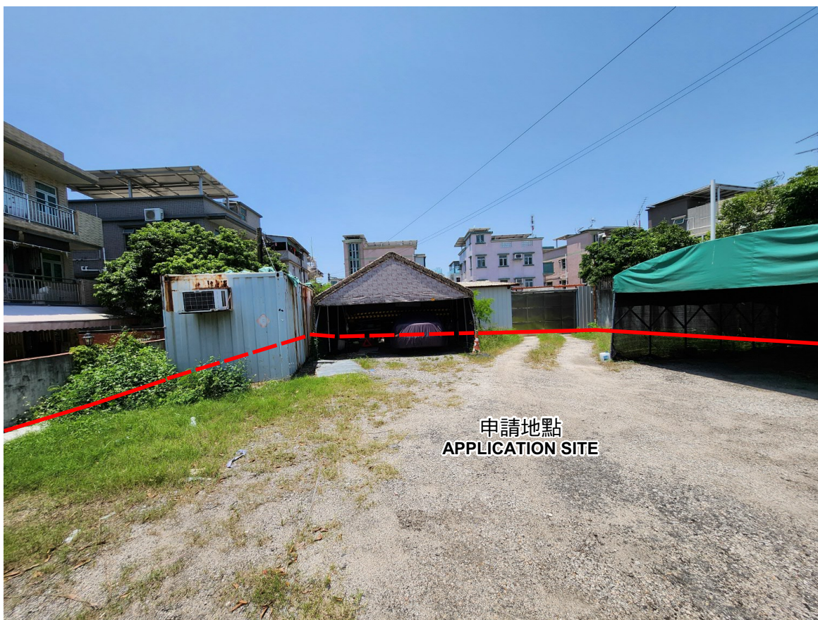
申請地點 APPLICATION SITE

申請地點界線只作識別用 APPLICATION SITE BOUNDARY FOR IDENTIFICATION PURPOSE ONLY