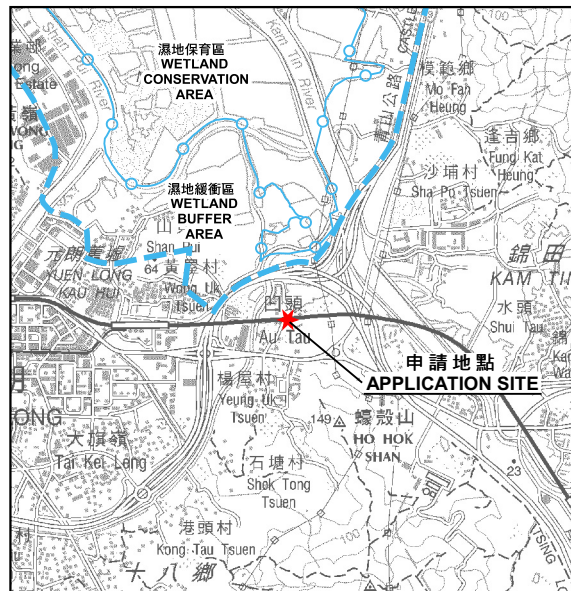
要覽圖 KEY PLAN SCALE 1 : 50 000 比例尺