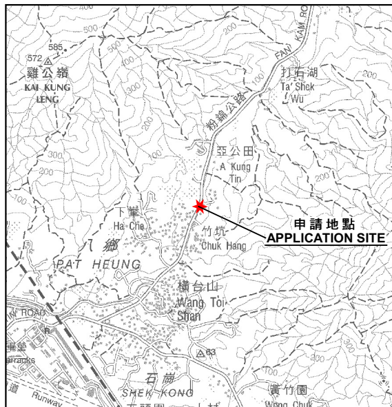
要覽圖 KEY PLAN