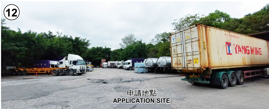
申請地點 APPLICATION SITE

申請地點界線只作識別用 APPLICATION SITE BOUNDARY FOR IDENTIFICATION PURPOSE ONLY