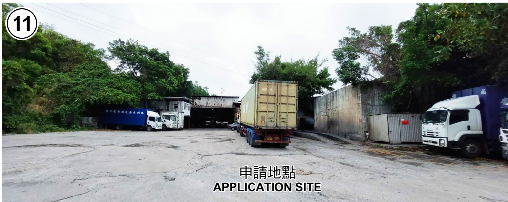
申請地點 APPLICATION SITE