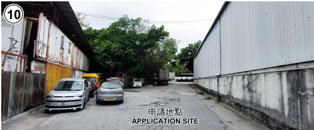
申請地點 APPLICATION SITE