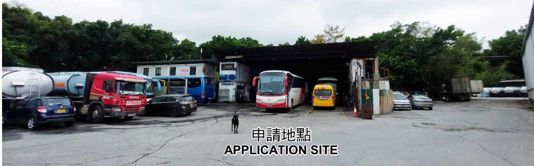
申請地點 APPLICATION SITE